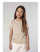
SOL'S CRUSADER KIDS 03580